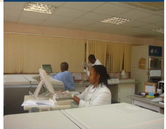
National Blood Transfusion Centre staff using state of the art ABBOTT Architect to screen for blood borne infections. The equipment is one of the many devices procured through SCMS.