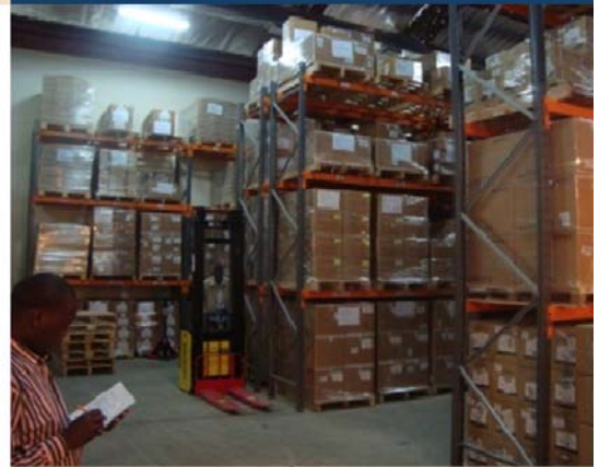
RDC warehouse serves Kenya, Tanzania, Uganda, Rwanda and Ethiopia.

SCMS procures essential medicines and supplies at affordable prices; helps strengthen and build reliable, secure and sustainable supply chain systems; and fosters coordination of key stakeholders. SCMS helps to reduce the price of essential medicines by working closely with clients to plan future procurement, pooling orders to buy in bulk, establishing long-term contracts with manufacturers and purchasing generic alternatives whenever possible.